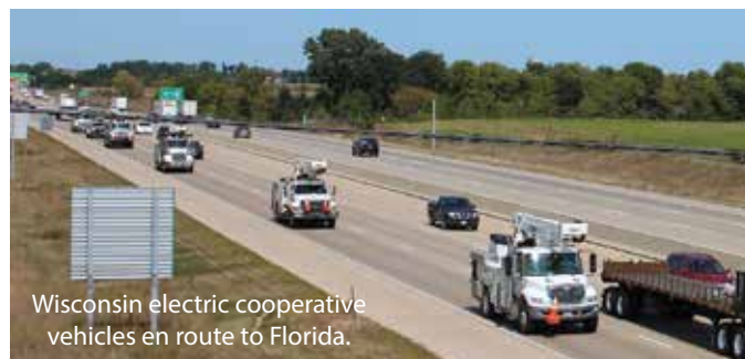
Wisconsin electric cooperative vehicles en route to Florida.

12 hours of 45 to 72 mph of wind. Black Creek, the St. Johns River and other local waterways in the area were all flooded. The hurricane impacted 858 homes in the county. Of those, a total of 275 were destroyed, 175 sustained major damage, 124 had minor damage, and the remainder were affected in other ways. The flood waters of Black Creek, which flows into the St. Johns River and then the Atlantic Ocean, topped out at 28.5 feet on September 12, shattering the previous 1919 record of 25.3 feet for the northern end and 26.3 feet for the southern end, set in 1944.